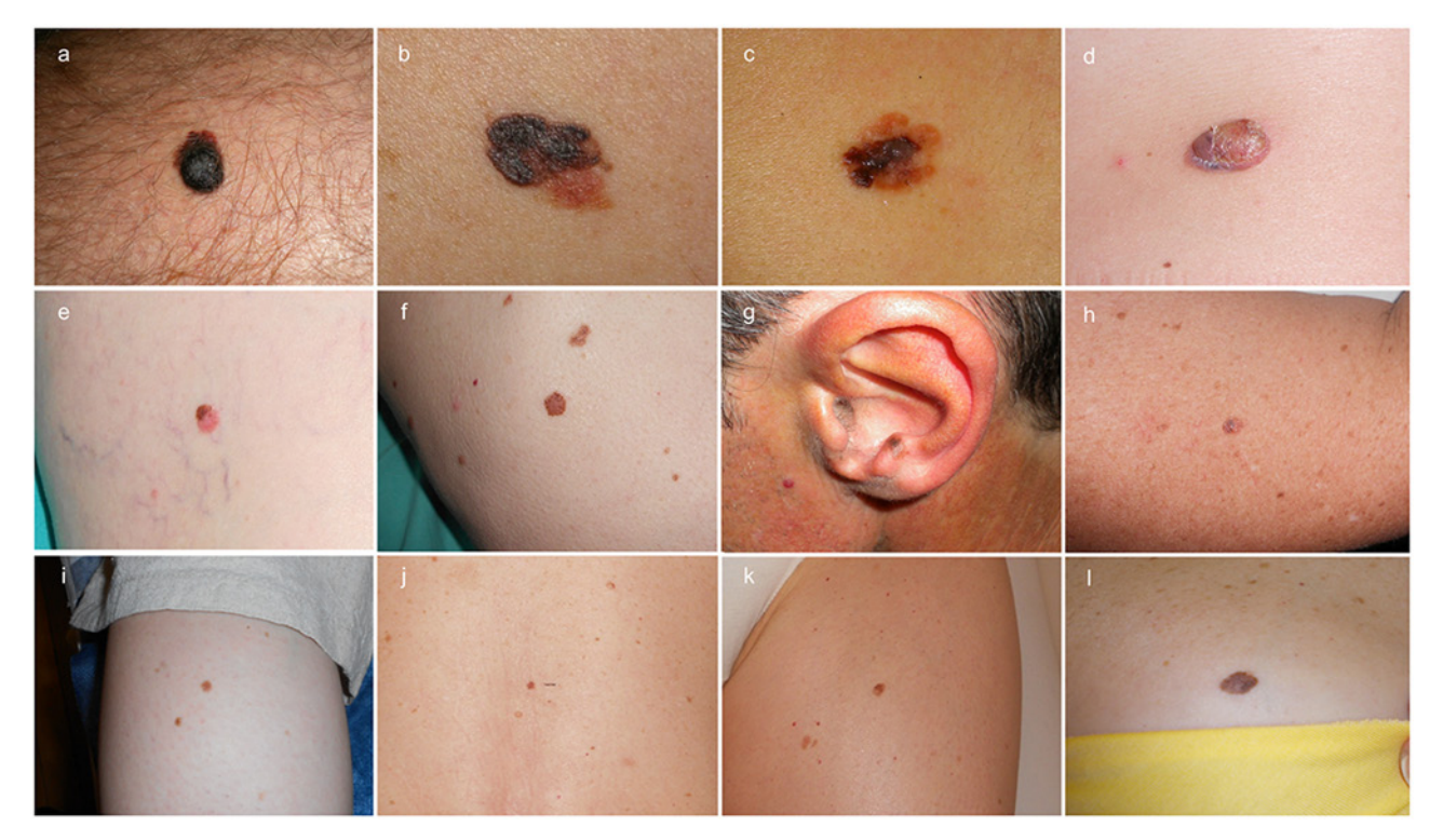
Figure 1. (A-D) Clinical images of melanomas that led to patient's consultation (MMC), (E-H) melanomas detected during routine control (MMRC), and (I-L) melanomas detected due to changes during digital dermoscopy follow-up (MMDFU).